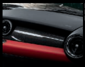
Interior surfaces in Carbon