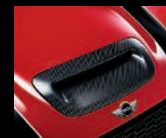
Air intake trim in Carbon