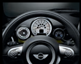
Additional instruments in conjunction with Always Open Timer (only one may be fitted)