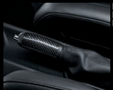
Handbrake grip in leather/Carbon