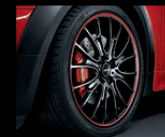
Cross Spoke R113 with Red Stripe, size 7J x 18 inches