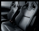
Sport seats in leather