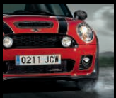
Aerodynamic package front apron