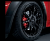
Double Spoke R105 in Matt Black, size 7J x 18 inches