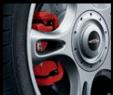
Sport brakes, 16 inches, with perforated and slotted brake discs