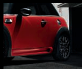
Side skirts 2