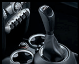
Gear lever knob and gaiter in leather/Carbon