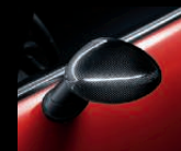
Exterior mirror caps in Carbon