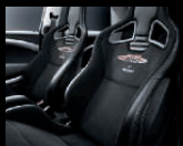
Sport seats in Alcantara