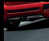
Diffuser in Carbon