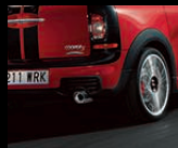
Sports silencer, tailpipes, in Chrome 1