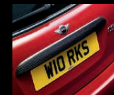
Tailgate handle in Carbon