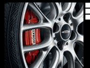
Sport brakes, 17 inches, with perforated and slotted brake discs