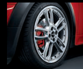
Double Spoke Composite R109, size 7J x 18 inches