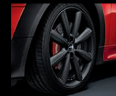
V-Spoke R133 in Matt Black, size 7J x 18 inches