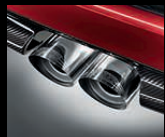
Sports silencer, tailpipes, in Chrome 1