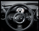
Sports steering wheel 1 in leather, with optional Carbon trim 2