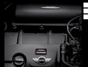
Engine with optimised engine management 1