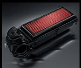
Air filter system 1