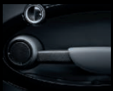
Interior door grips in Carbon