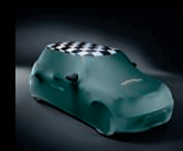
Indoor car cover