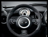
Sports steering wheel 1 in Alcantara, with optional Carbon trim 2