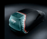
Indoor car cover