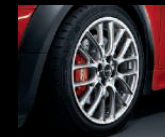
Cross Spoke Challenge R112, size 7J x 17 inches