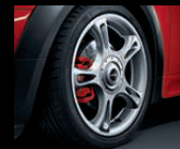
Star Spoke R95, size 7J x 18 inches