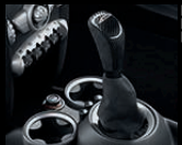
Gear lever knob and gaiter in Alcantara/Carbon