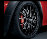
Cross Spoke R113 in Brilliant Black, size 7J x 18 inches