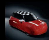
Outdoor car cover