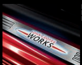
Door sill finishers with logo (illuminated or non-illuminated)