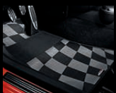
Floor mats with Checkered Flag design