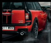
Aerodynamic package rear apron