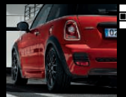
Aerodynamic package rear apron